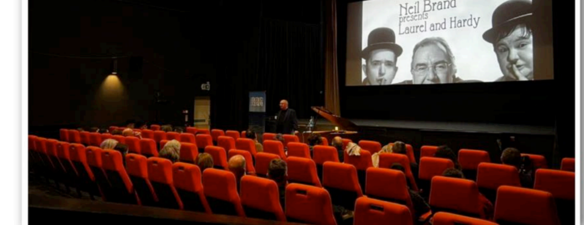
Oban Phoenix Cinema

Adding a festive touch to their outings, the residents will be participating in the upcoming Oban Winter Festival, reveling in the seasonal cheer and community spirit that the event brings. From dazzling lights to the aroma of festive treats, it will be an experience that resonates with the joy of the holiday season.