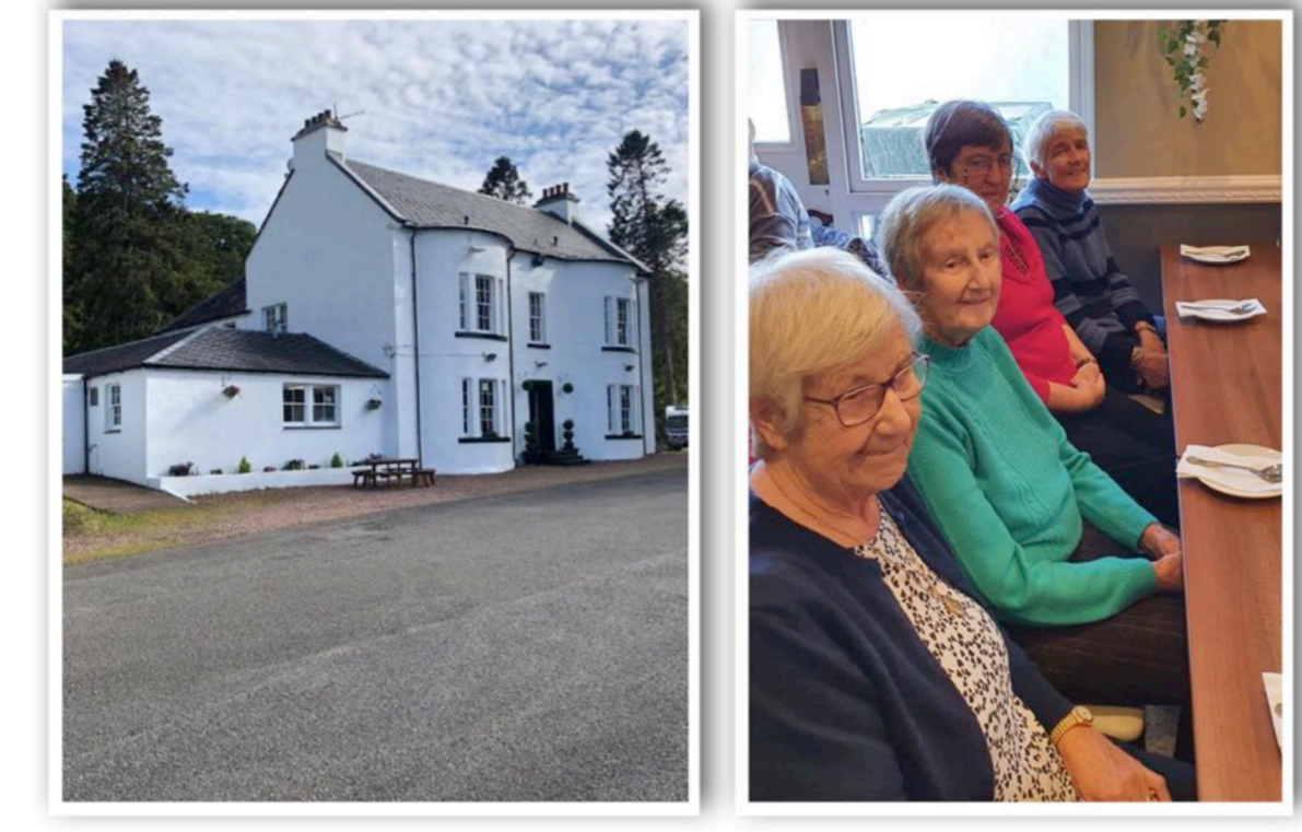
Soroba House, Oban

At Etive House, the residents have had a busy month with exciting activities and celebrations. They enjoyed weekly visits from Honey, the therapy dog and went on trips to the cinema. Additionally, they had weekly Soroba House visits, which brought joy to their routines.