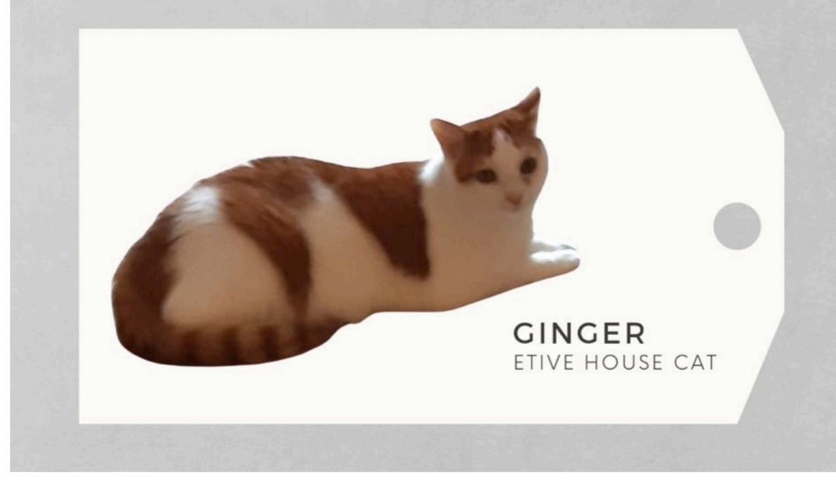
GINGER ETIVE HOUSE CAT